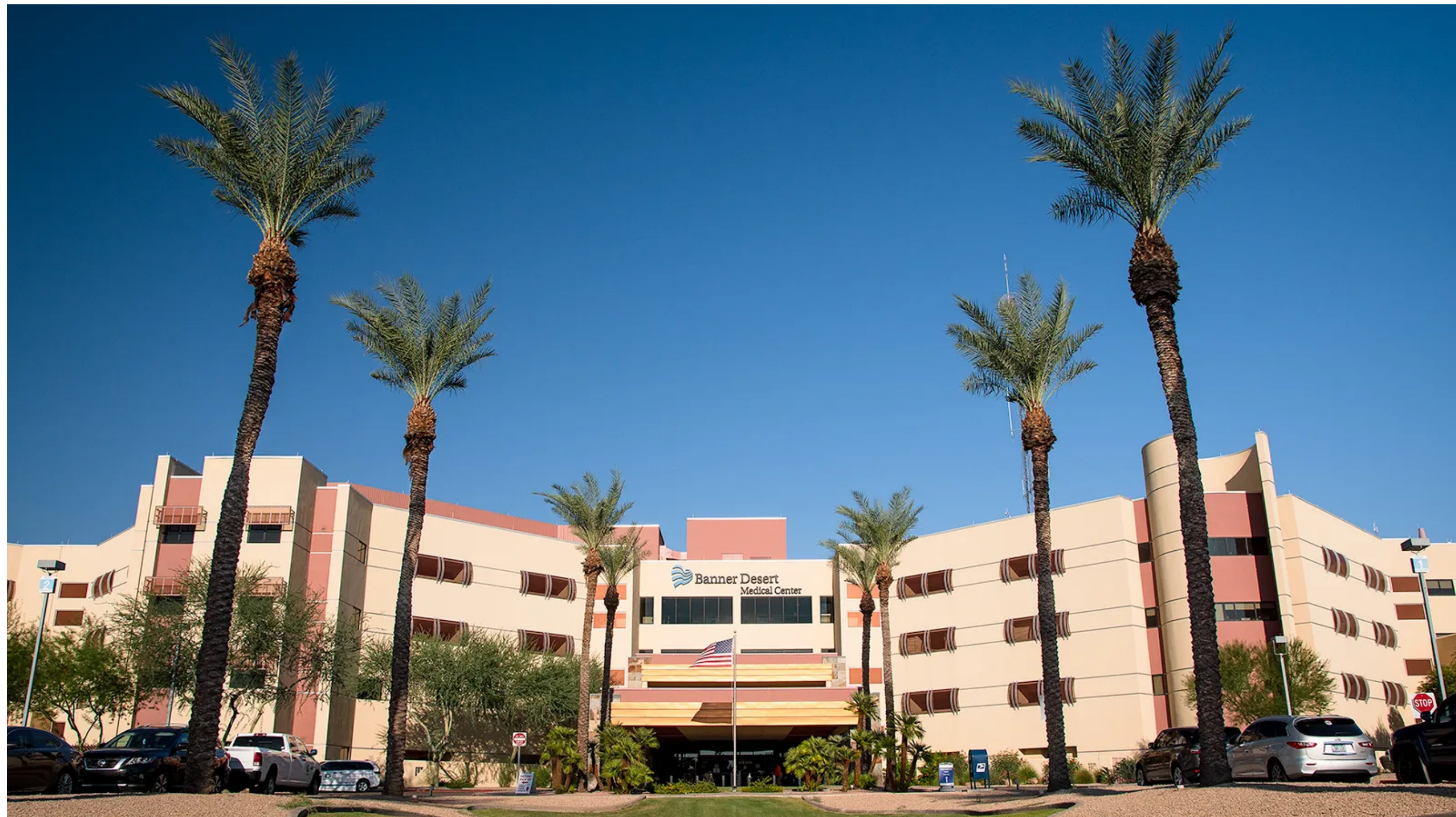
Banner Health turned to MCC to help fill an industry void in the biomedical technology field with a certificate program.